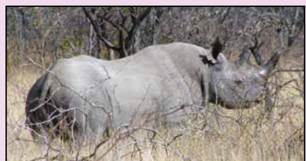
Tangarira photographed in the open

Guarding the black rhino involves hours of tracking, through rough terrain and thickets of thorn trees. Conditions can be extremely hot and dangerous. In very thick bush there is the constant risk of being charged by the rhino if the wind changes and they get your scent.