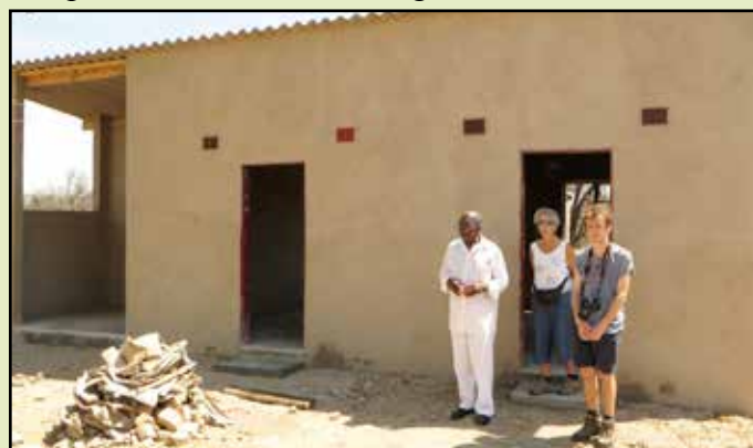
Nearly completed maternity waiting rooms

This medical clinic serves the local community and continues to extend and improve its range of services. They have recently received a large chest freezer and fridge, for storage of vaccines and medicines, and a separate freezer containing freezer blocks for use