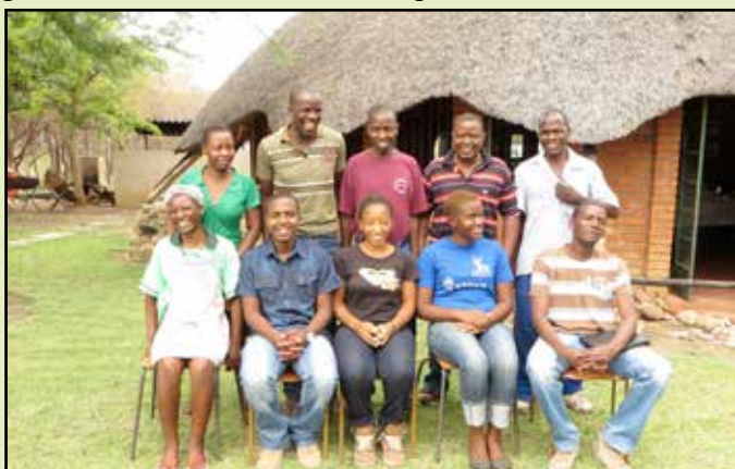
Staff and students of the Sebakwe Conservation and Education Centre

For many parents of the children at the more rural schools the possibility of their children attending and paying for a camp at the Education centre is just a dream. As we witnessed, when we visited several different schools in November, many of the families are not even able to pay the school fees of around USD 13 a term. The facilities at the Education Centre offer the chance for school children to learn about conservation and wildlife at the same time as having great fun and a memorable experience.