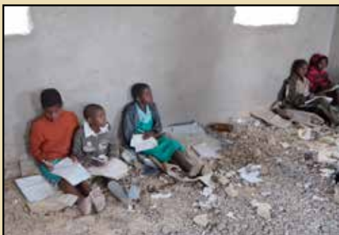
Rubble classroom floors

Schools round up: As the population increases in the resettlement areas surrounding the conservancy, the demand for secondary school places is increasing. We saw an impressive display of building at the Chiwodza secondary school where state funding had allowed contractors to make rapid progress; seven bricklayers had built a large classroom block up to the roof line in five days! Unfortunately, due to lack of funds, progress is slower at other schools. At Messina primary new brick staff houses were being built but the pole and mortar classrooms are deteriorating rapidly and they still have no water and many children sit on the rubble floors. Mopane Park primary uses the buildings from an old farmstead and have a borehole but the pump mechanism has broken and needs urgent repair. Rockvale primary children put on an amazing display of singing, poetry and dance. We delivered letters from Lindridge Primary School , Tenbury Wells, UK. One classroom still has no roof and there are only four toilets for 200 children and the staff. Sadly we arrived too late in the day to see the performance planned by Paudale children but Sebakwe primary put on a superb impromptu show of singing, drama and basketball (with the new ball we gave them).