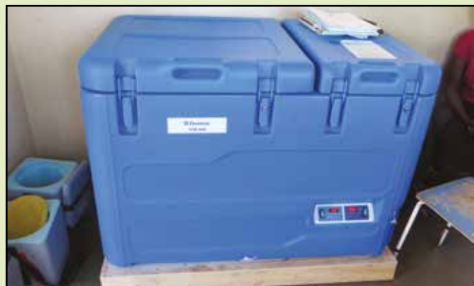
New fridge freezer for medicines and vaccines

This medical clinic serves the local community and continues to extend and improve its range of services. They have recently received a large chest freezer and fridge, for storage of vaccines and medicines, and a separate freezer containing freezer blocks for use