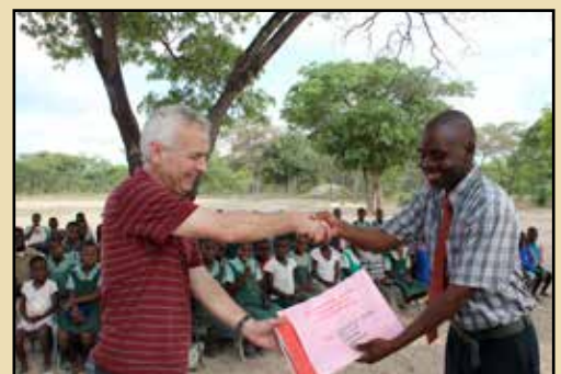
Exchange of letters at Rockvale school

We were struck by the warmth and enthusiasm of the school teachers, the beautiful singing voices of the children and their exuberance, especially when presented with shiny new footballs. Yet we were reminded of the harsh environment that the children and teachers face each day; with long walks to school, limited water supplies, many classrooms with no furniture at all, rubble floors and limited teaching resources, making learning and teaching an incredible task.