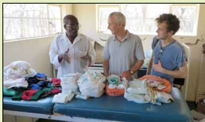
Donated supplies for the clinic

during the not infrequent power cuts. Unfortunately electricity supplies can still be erratic. The maternity waiting rooms and new staff houses are nearing completion. These will allow expectant mothers to travel to the clinic several days before they are due to give birth so avoiding travelling long distances when in labour.