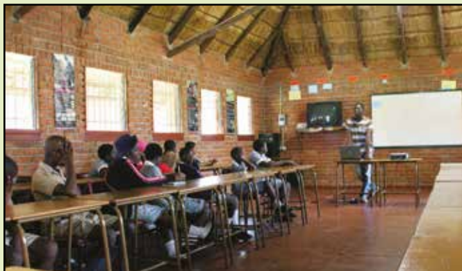
Children learning about black rhino