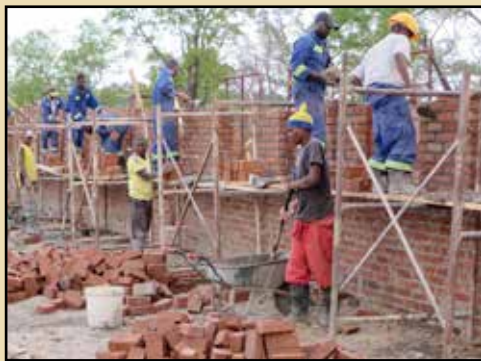
Impressive bricklaying at Chiwodza secondary school

How are farm bricks made? In brief: take clay from an old termite mound, add water, put in a brick shaped mould, dry, 'bake' in a kiln for a several days and you have the building blocks for a new school. So far very impressive toilets and some staff houses have been built. It is hoped that with extra funding they can make a start on the classroom blocks.