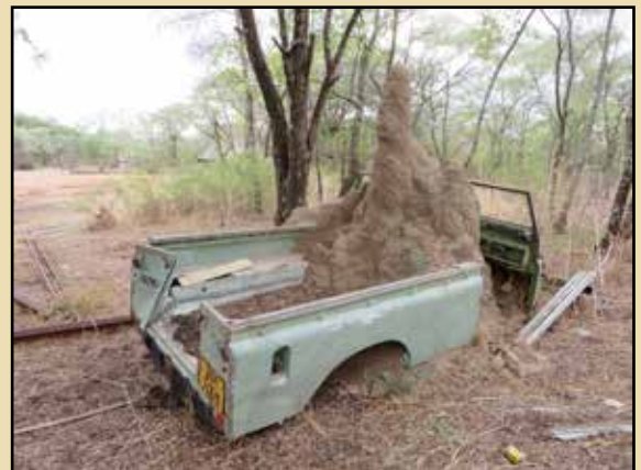
Termite mound - engulfing a Land Rover!

In the Paudale area the parents have been busy building so called 'farm bricks' out of termite mound clay. This clay has special properties which make it especially good for brick making.