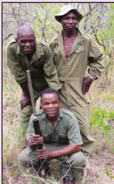
3 of the 9 rhino monitors

order to maintain his protection and keep him in the conservancy.