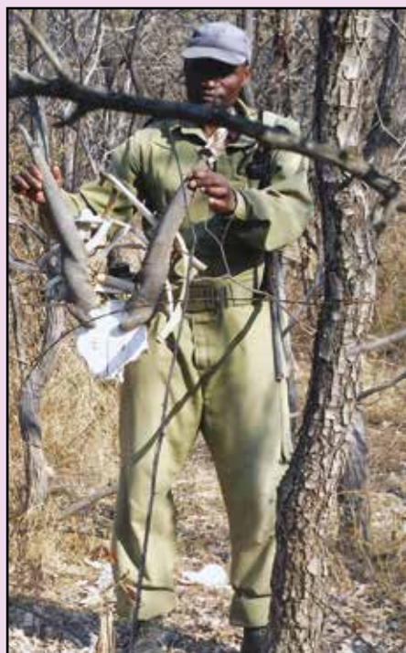
Remains of an Eland found in a snare

All leave was cancelled and two teams of monitors were deployed, tracking Rancy and leapfrogging each other to get in front of him. Then they would be able to try to head him off and turn him back. Five men had to camp out in the bush for several days continually looking for foot prints crossing the sand roads. This was hampered by torrential rain washing away the spore. After five