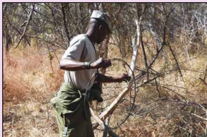
Removing a wire snare attached to a tree

Poaching of game is a constant threat. The rhino monitors and farm game guards are always on the lookout for wire snares set between trees along game trails. These are designed to ensnare the necks of antelope passing by. Poachers also use dogs to chase and wear down their targets. In November an exceptionally heavy penalty was given to a group of poaches caught in the conservancy. Rhino monitors gave evidence to help convict the men who were each fined USD 1500 and sent to prison for 8 months! – It is hoped that this will be a massive deterrent to other potential poachers.