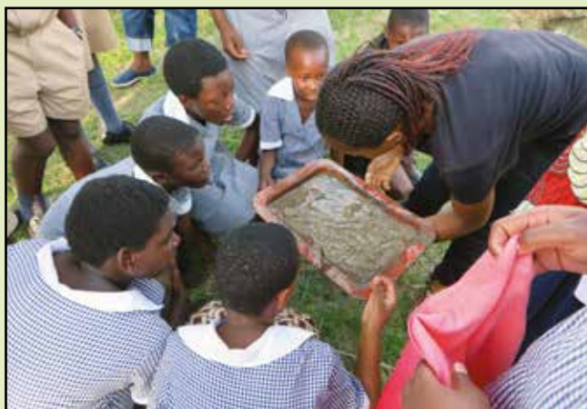
Looking for aquatic animals

The excitement in the children was mounting and they were then taken into the bush in the back of the centre's pick-up truck to the nearby Shari dam. The school had been asked to re-enact their award winning play and this was performed on large rocks with a back drop of the dam waters, true open air theatre. This was followed by a practical session demonstrating how water pollution can be assessed by monitoring the animal population in sludge sediments. Water and animals are always fascinating for children and a lot of fun and laughter was had by all.