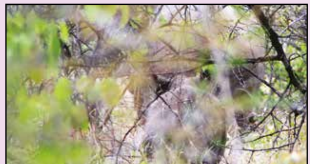
Tafara, 8 month old calf, following her mother, Tendai in very thick bush

After seeing the bull we continue the search for the mother and calf who have wandered off. In total we spend 9 hours on our feet, for me it's a one off, but for Misheck, and the other black rhino monitors, it's all in a day's work. It's these men led by David Strydom who we are to thank for the survival of our now six rhino in the conservancy. Without them these beautiful rhino would surely have been poached.